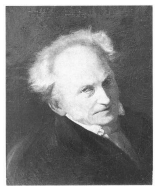
8. Schopenhauer: portrait by Julius Hamel, 1856

fulfilment of some desire or end. What we call happiness is usually felt on attaining one of our ends, or it may be the temporary absence of anything further to strive for. But these kinds of pleasure and happiness, since they depend on willing, also carry with them the permanent possibility of suffering. In the first place, all willing 'springs from lack, from deficiency, and thus from suffering' ( W1 , 196). Secondly, when any particular desire is stilled, the subject of willing soon experiences another deficiency. Thus to be driven by the will is to oscillate between suffering and satisfaction, and Schopenhauer is convinced that the suffering lasts longer, the satisfaction being only a temporary return to neutral before another lack is felt.