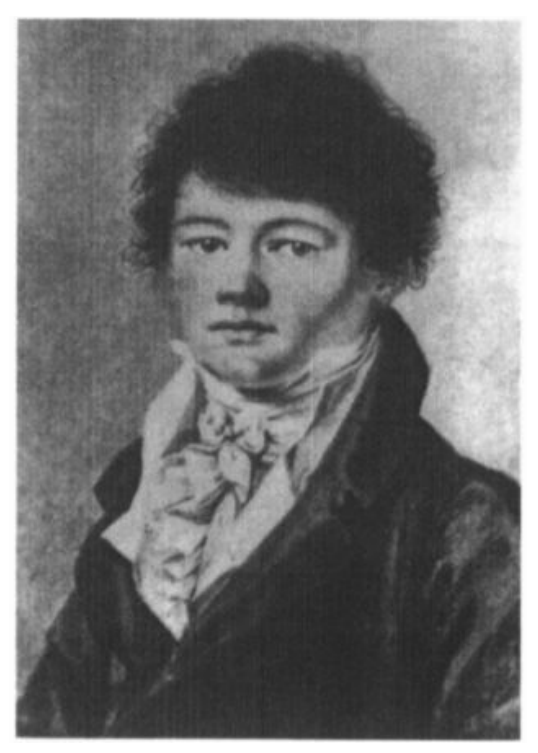
2. Schopenhauer as a youth, 1802

knowledge is limited. The will is not easy to define. It is, to begin with, easier to say what it is not. It is not any kind of mind or consciousness, nor does it direct things to any rational purpose (otherwise 'will' would be another name for God). Schopenhauer's world is purposeless. His notion of will is probably best captured by the notion of striving towards something, provided one remembers that the will is fundamentally 'blind', and found in forces of nature which are without consciousness at all. Most importantly, the human psyche can be seen as split: comprising not only capacities for understanding and rational thought, but at a deeper level also an essentially 'blind' process of striving, which governs, but can also conflict with, the conscious portions of our nature. Humanity is poised between the life of an organism driven to survival and reproduction, and that of a pure intellect that can rebel against its nature and aspire to a timeless contemplation of a 'higher' reality.