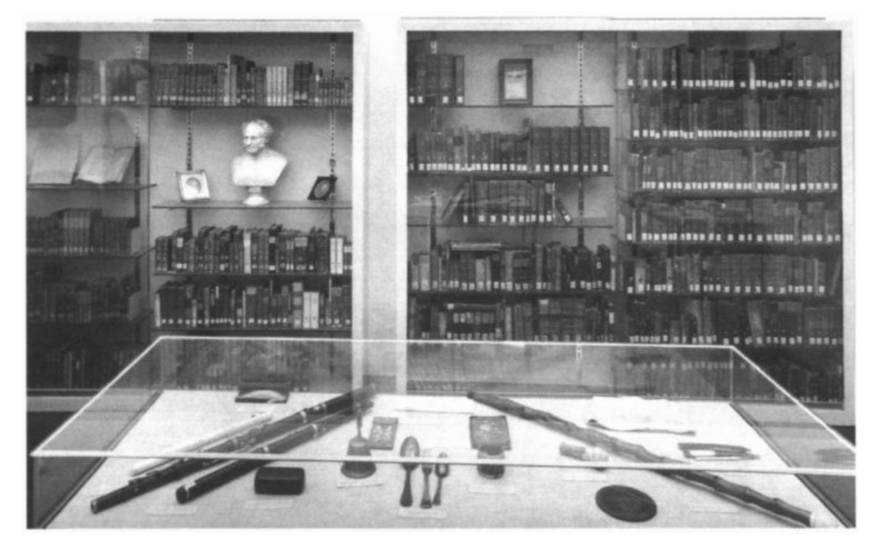
9. Schopenhauer's flutes among other objects in the Schopenhauer-Archiv, Frankfurt am Main