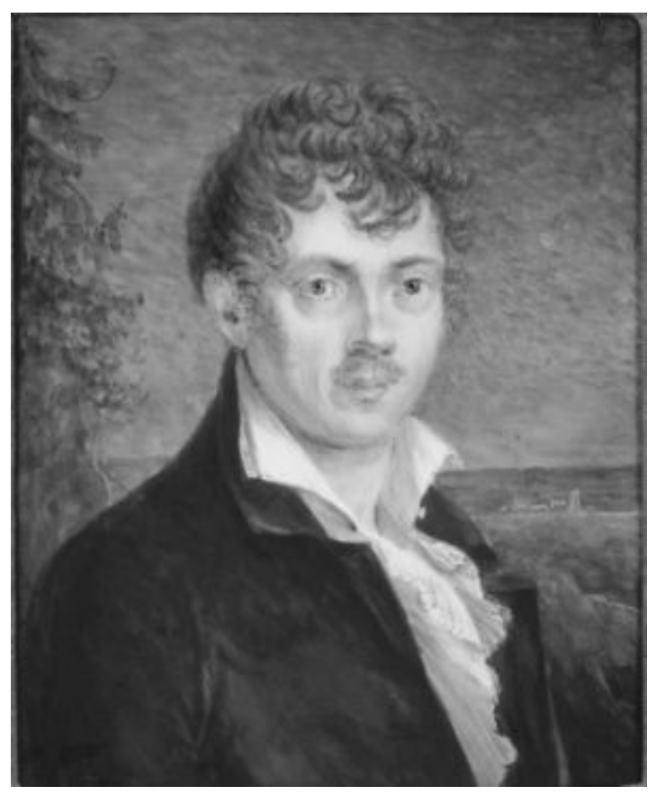
3. Schopenhauer: miniature portrait by Karl Ludwig Kaaz, 1809